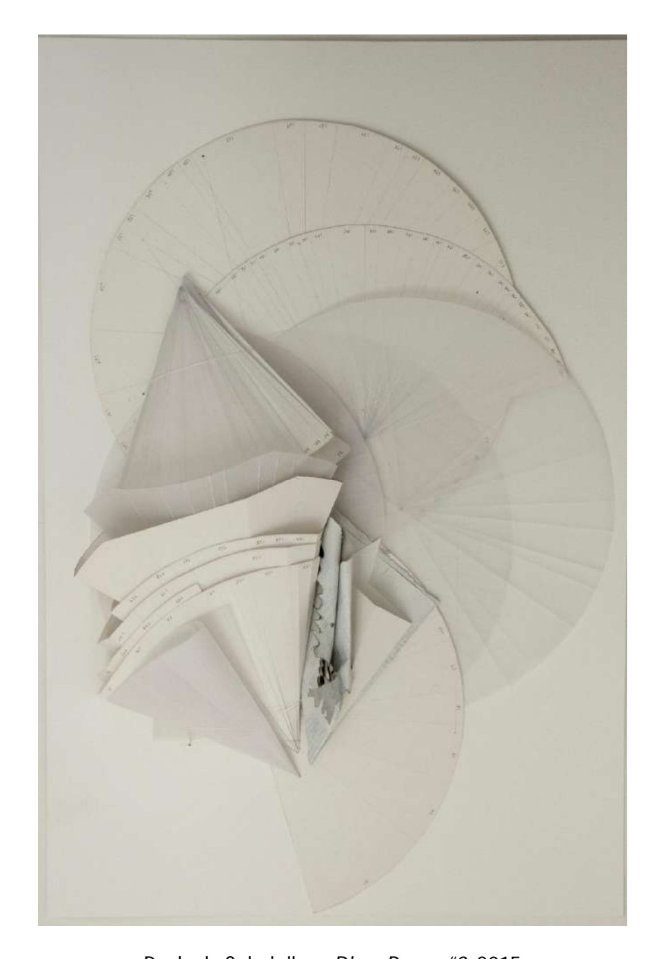
Paula de Solminihac, Diary Pages #8 , 2015 sketches, proofs and remains on paper, ceramics and other materials from the artist diary 60x40 cm or 23,6 x 15,7 in Unique art work

The circle is often present in the work of the artist whose approach is inspired by themes developed by the contemporary archaeology, such as the metamorphosis of materials and the cycle of life.