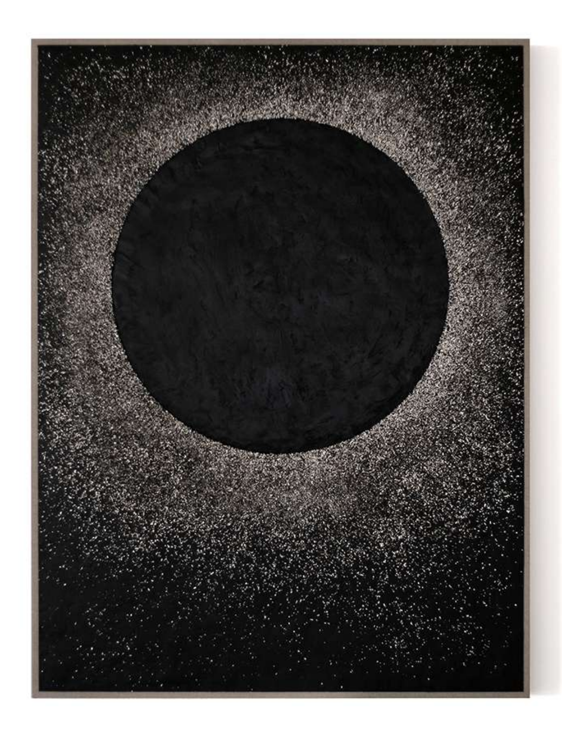
Jorge Rosano Gamboa, Ergosphere I , 2025 Encaustic, animal bones, and ashes on linen, 120x90 cm or 47,2 x 35,4 in