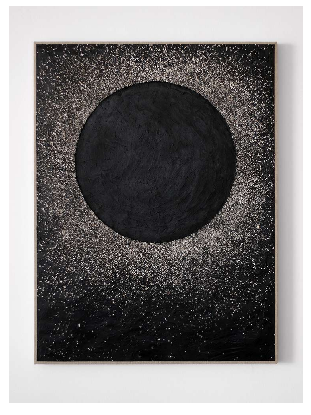
Jorge Rosano Gamboa, Ergosphere II , 2025 Encaustic, animal bones, and ashes on linen, 80 x 60 cm or 31,4 x 23,6 in