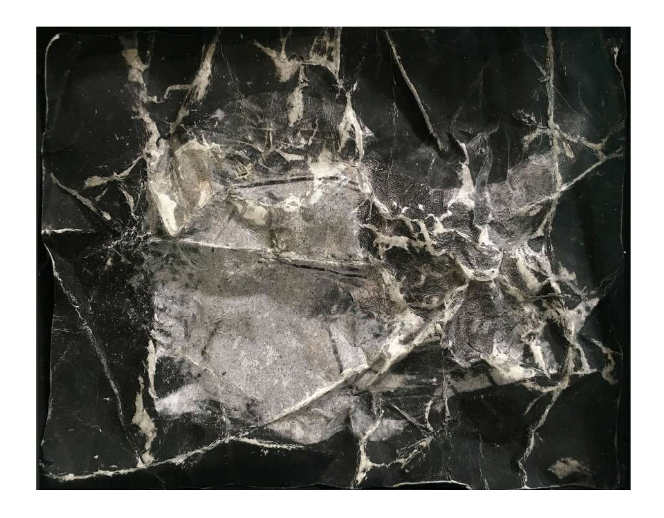
Paula de Solminihac, Black Bark #5 natural print on inkjet print, 29 x 22cm or 11.4 x 8,6 in + frame, 2016