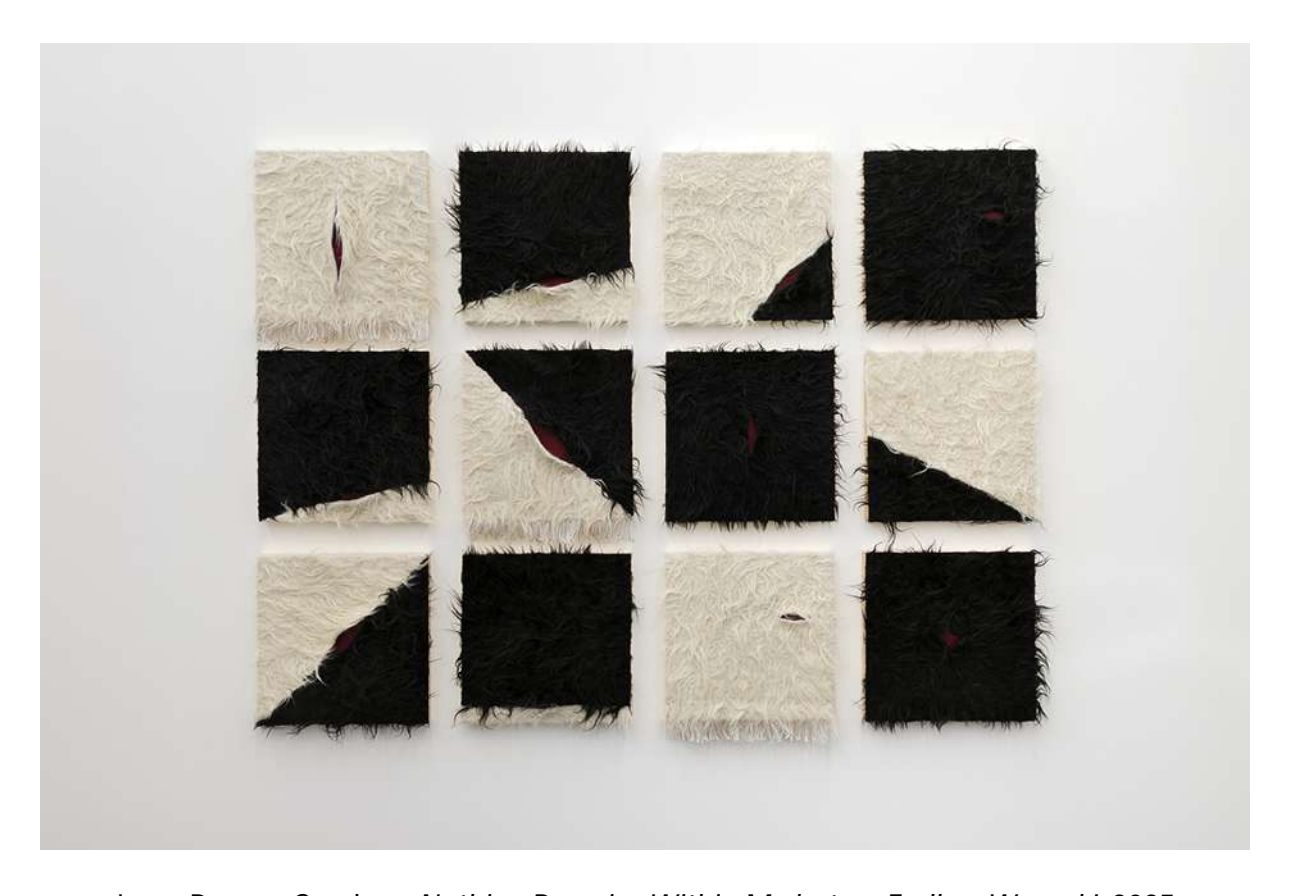
Jorge Rosano Gamboa, Nothing Remains Within Me but an Endless Wound I , 2025 Wool, gold leaf, encaustic and cochineal on a wooden frame 40 x 40 x 4 cm or 15,7 x 15,7x 1,6 inches each