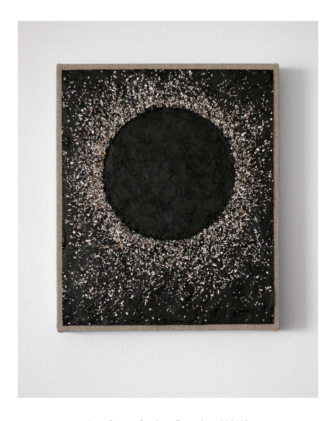
Jorge Rosano Gamboa, Ergosphere IV , 2025 Encaustic, animal bones, and ashes on linen, 30 x 25 cm or 11,8 x 9,8 inches