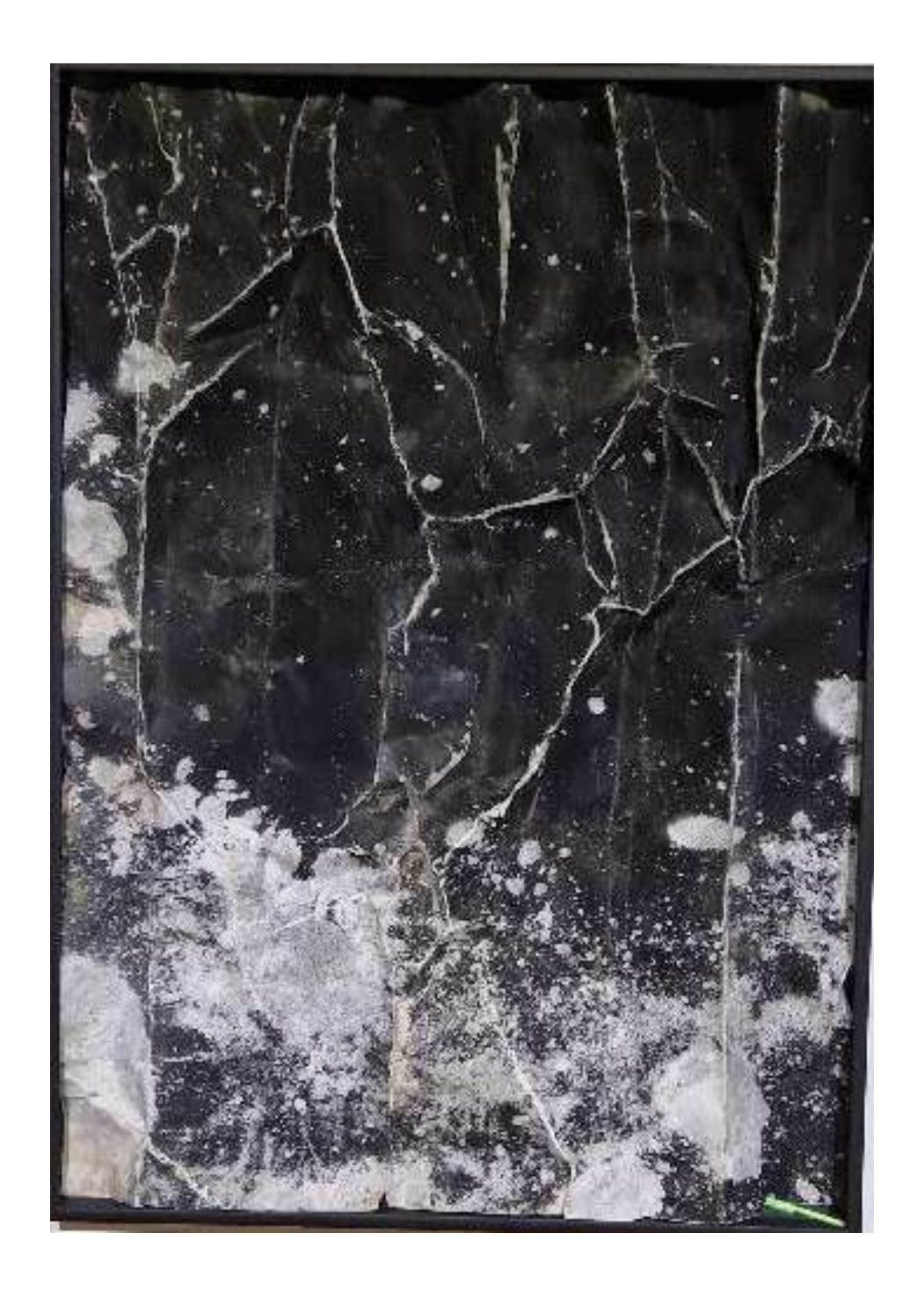
Paula de Solminihac, Black Bark #2 natural print on inkjet print, 40 x 60 cm or 15,7 x 23,6 in+ frame, 2016